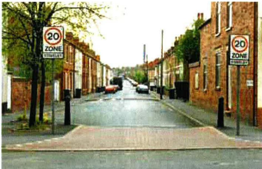
Fig. 7.2 Entry treatment at the start of a 20 mph zone

visual impact on the local environment should be weighed up against the slight potential for additional speed reduction.