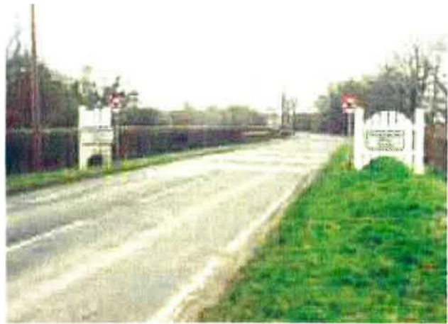
Fig. 7.1 Village gateway at Charlwood

7.2.1 A gateway (Fig. 7.1) should be sited so that drivers do not encounter it suddenly. It should be visible over at least the stopping distance for the 85th percentile of the approach speed of vehicles.